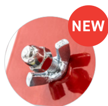
Cylinder Bracket Retention System