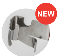
Hand Piece Holder