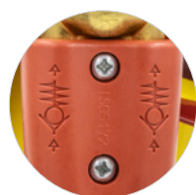
Inbuilt Flashback Arrestor, Torch End