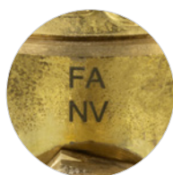
Inbuilt Flashback Arrestor, Regulator End