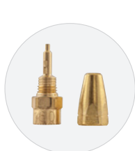
Unique Two Piece Nozzle Design