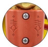
Inbuilt Flashback Arrestor, Torch End