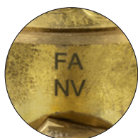
Inbuilt Flashback Arrestor, Regulator End