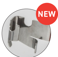
Hand Piece Holder