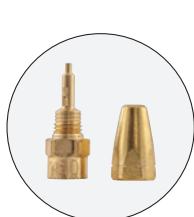
Unique Two Piece Nozzle Design